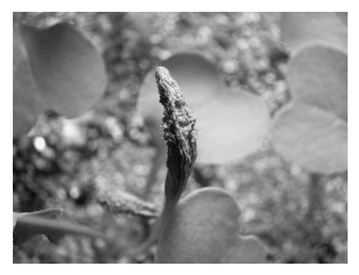
Figure 3. The dominant FPsc ale mutant allele causes pronounced leaf curling.

On the other hand, dominant alleles often result from "gain of function" mutations whose effects are evident even if present in just a single copy. As a hypothetical example, imagine a mutation that alters the substrate specificity of a key metabolic enzyme such that the encoded gene product enables the organism to harvest energy from an additional carbohydrate source in its environment – for example, let's say an organism carrying the mutant allele, expressed in precisely the same tissues and at the same level of expression as its wt counterpart can digest both glucose and sucrose, whereas individuals that carry only the wt allele must live on glucose alone. If sucrose is plentiful in the environment and carbon sources are growth-rate limiting, the heterozygote will likely enjoy a fitness advantage over the wt homozygote.