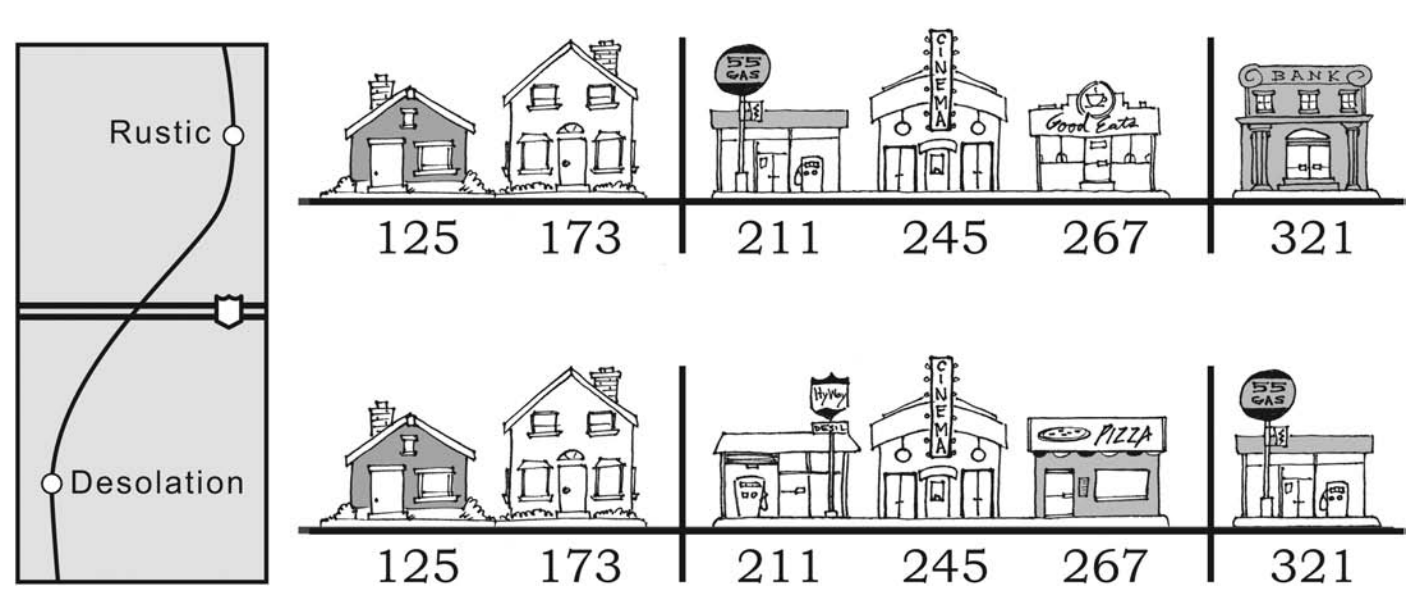
Figure 1. Towns of Rustic and Desolation.

prepared foods and is called "Good Eats," we explicitly assert that we have considerably more knowledge of many things regarding the structure and activities at 267 Main Street, perhaps including the quality of the food, the likelihood of getting a table during the dinner hour, the price of entrees, and so on. That is, we can be much more specific and authoritative in our choice of vocabulary ( gene ).